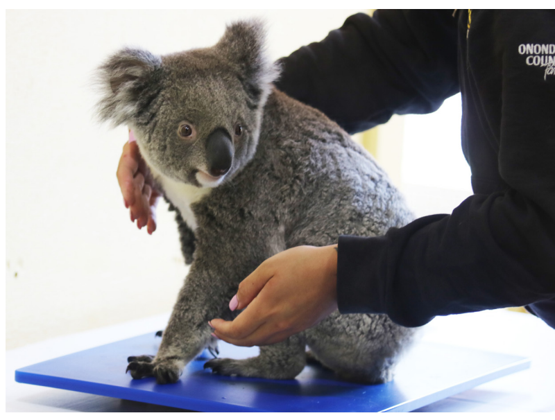
Alana weighs Kumiri for a routine health checkup.