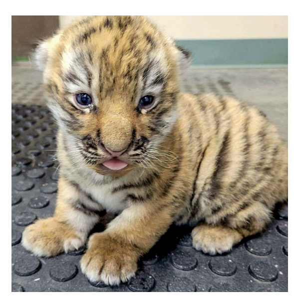
The female cub, pictured at 3 weeks of age, is lighter in color than her brother and quieter in personality.

This was the first time that either tiger became a parent, and the animal care team didn't know what to expect from Zeya and Thimbu.