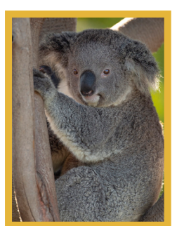
ON THE COVER Koala Kumir