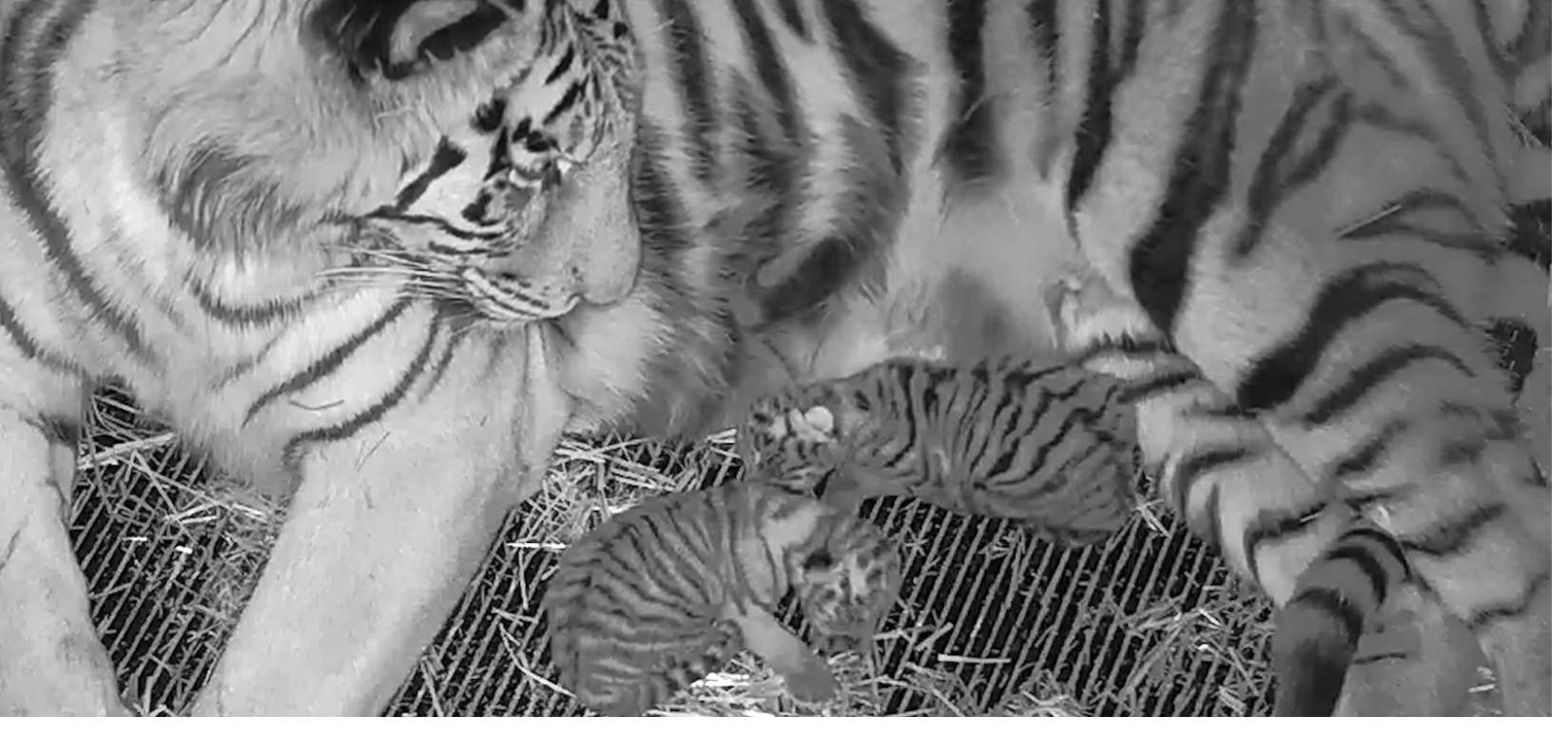
Pictured: The view from the live Amur Tiger Cub Cam in the Animal Health Center on May 2.